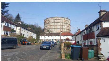
View from Johnsdale of existing gasholder

Further information can be found on the Oxted gasholder consultation website www.oxtedgasholder.co.uk ."