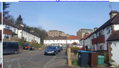
View from Johnsdale of the proposed scheme

Musical Memories - Musical Memories sessions are running in Oxted. Formerly known as 'singing for the brain', Musical Memories is now only £2 per person, including a cuppa, and the carer goes free. A music tutor leads the group for an hour of songs and music, in an engaging, relaxed and friendly setting. It is run by the Good Care Group. Any residents needing transport to the session, are invited to call East Surrey Dial a Ride on 01883 349001.