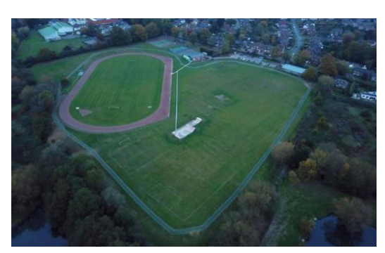
Trim trail constructed by local company Eezeegrip