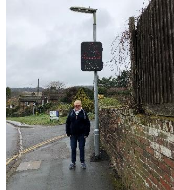
The new Vehicle Activated Sign on Barrow Green Road